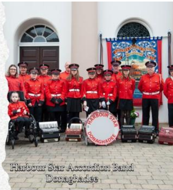
Harbour Star Accordion Band Donaghadee

With winter and the dark nights approaching the band are now recruiting in all areas :- side drum, bass drum, accordion (both piano and button} drum major. Tuition, instruments and uniforms are provided. Anyone interested in joining should message the page or call in to practice which is upstairs in Manor Street Orange Hall on Wednesday evenings from 7.30pm. We are a small friendly band with several families including young children. All ages from 9 up are welcome.