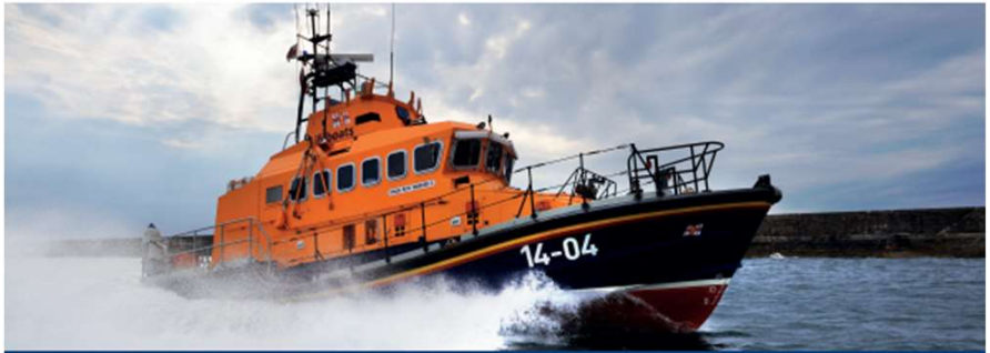
The RNLI is the charity that saves lives at sea The Royal National Lifeboat Institution, registered charity number [C177 2578 and 20003326] in the Republic of Ireland. Registered as a charity in England and Wales [209400], Scotland [SC037736] and the Bailiwick of Jersey [14], the Isle of Man [1308 and 005279], the Bailiwick of Guernsey and Alderney, at West Quay Road, Poole, Dorset, BH12 9JZ

Raft Race Unfortunately the raft race has had to be postponed